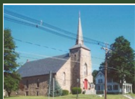
Kirkpatrick Memorial Presbyterian Church