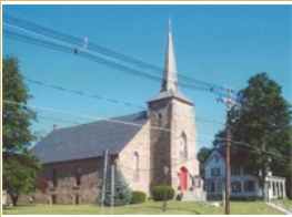
Kirkpatrick Memorial Presbyterian Church