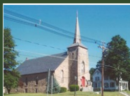
Kirkpatrick Memorial Presbyterian Church